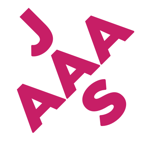
Vol. 2, No. 1 | 2020