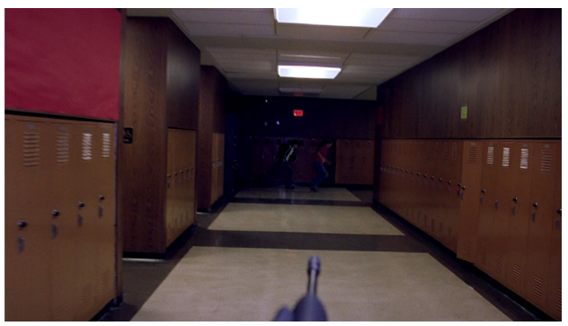
Illustration 3 : Eric plays a first-person shooter (left), whose aesthetics the film then remediates during the shooting (right).

Frame captures from Elephant © HBO Films, 2003. Images used in accordance with Austrian copyright law pertaining to the use of images for critical commentary.