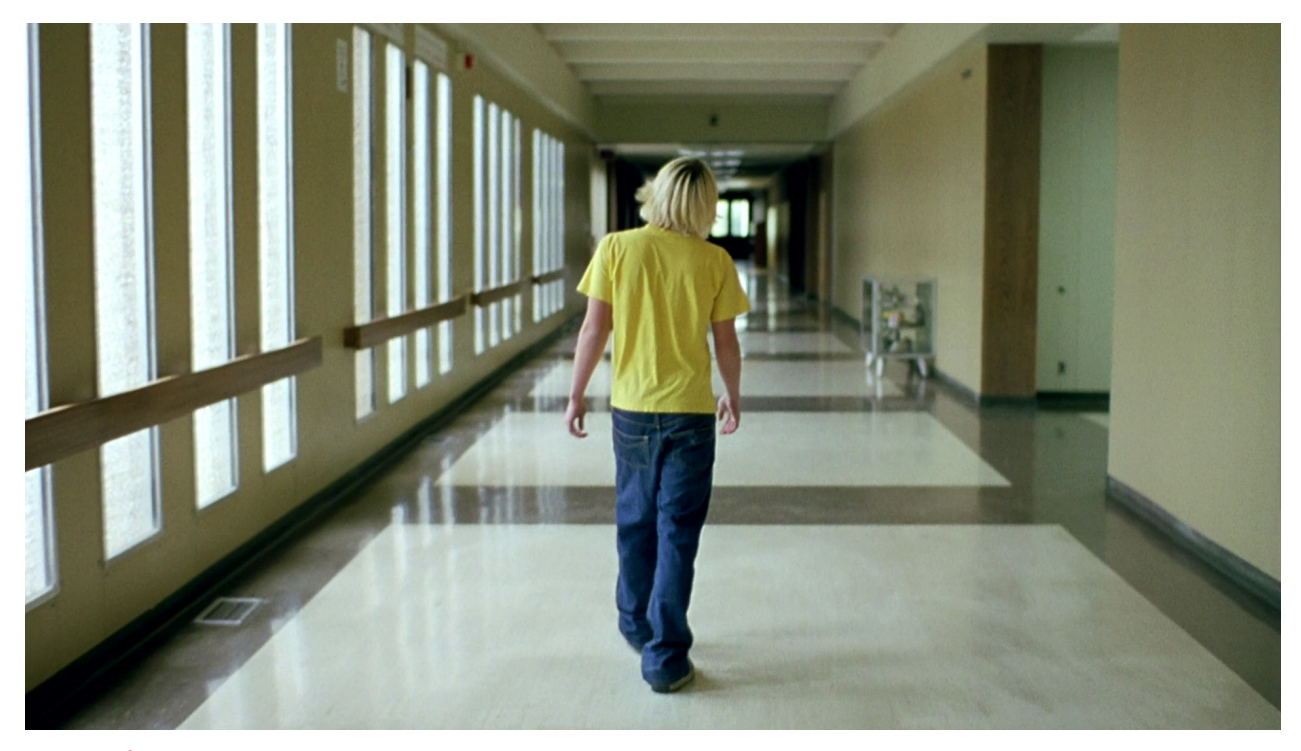
Illustration 2 : Numerous tracking shots follow students through the hallways. Frame capture from Elephant. Image used in accordance with Austrian copyright law pertaining to the use of images for critical commentary.